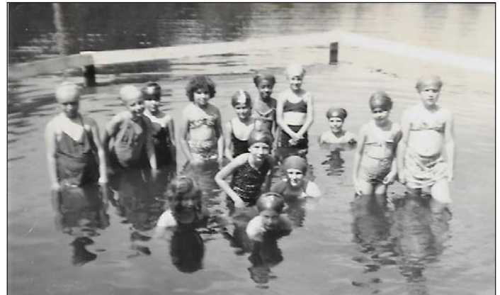
At left, swimmers on the dock; at right, non-swimmers in a lake enclosure for their own safety. 1947