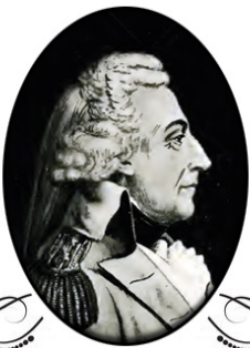
General Joseph Bloomfield