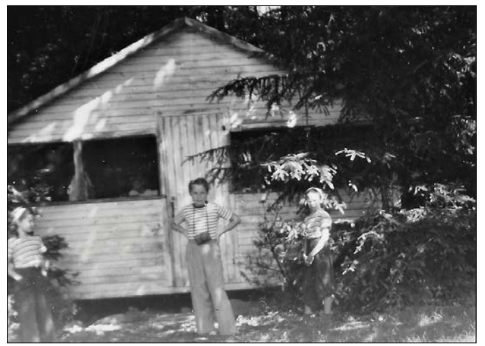
One of four "Caravan" cabins. 1947