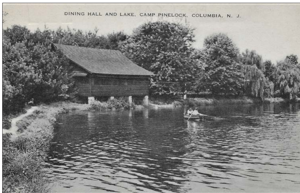
This 1954 postcard shows the Camp Pinelock dining hall and lake.