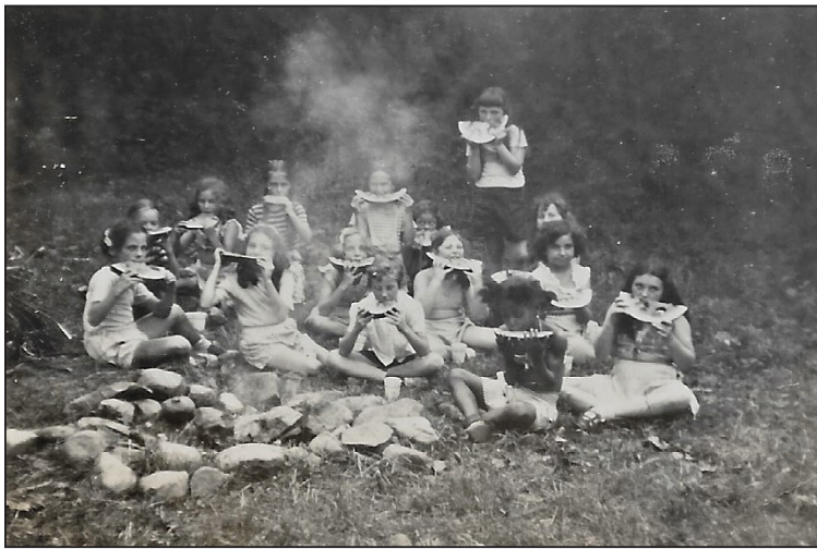
Enjoying watermelon, post foil cooking on the campfire. 1947