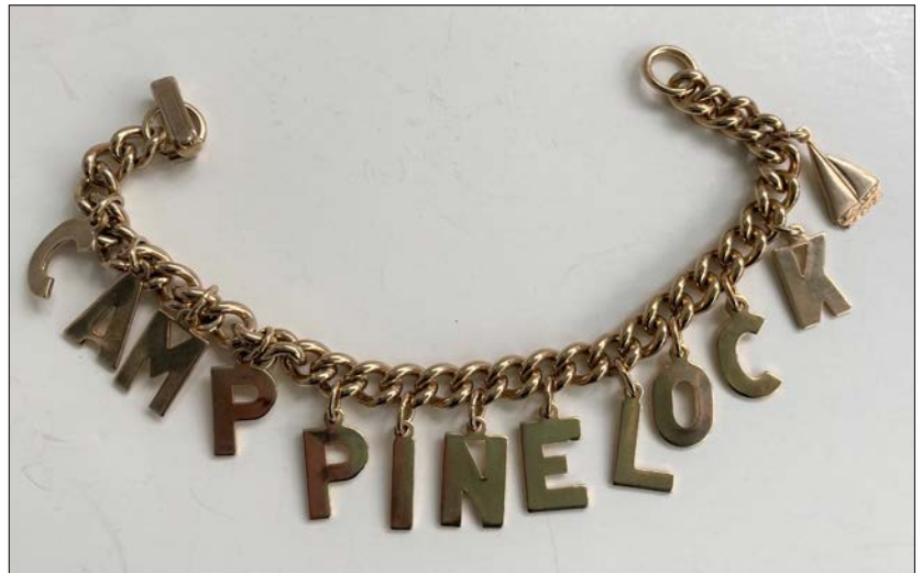
Gold-tone charm bracelet; note the sailboat.