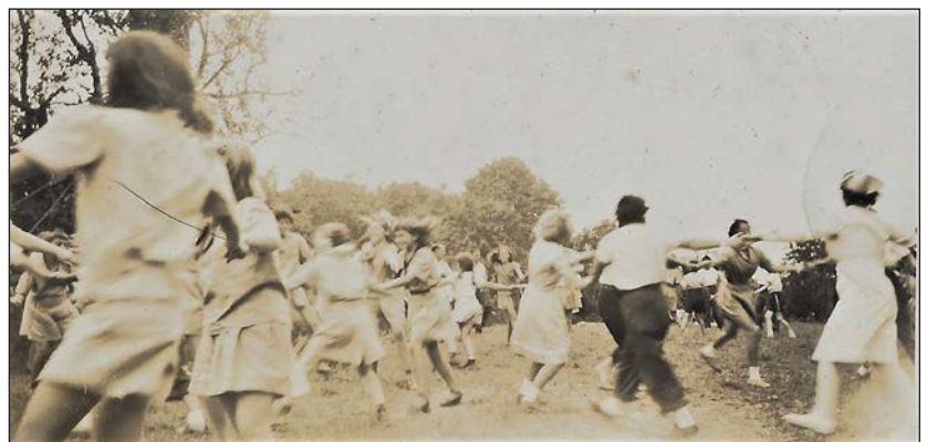
Square dance! 1947